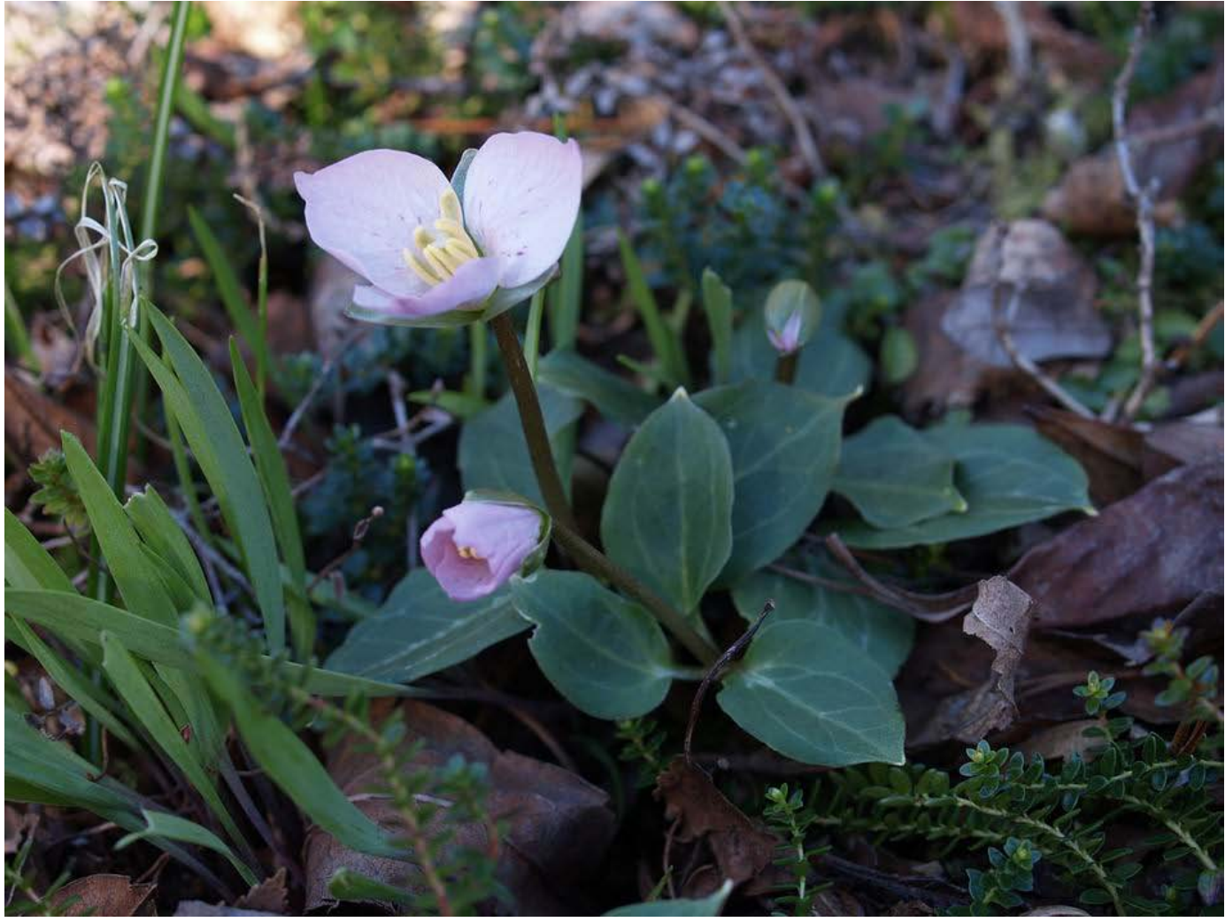
Two pictures of the same seedling show the difference between using natural light, above, and flash, below.