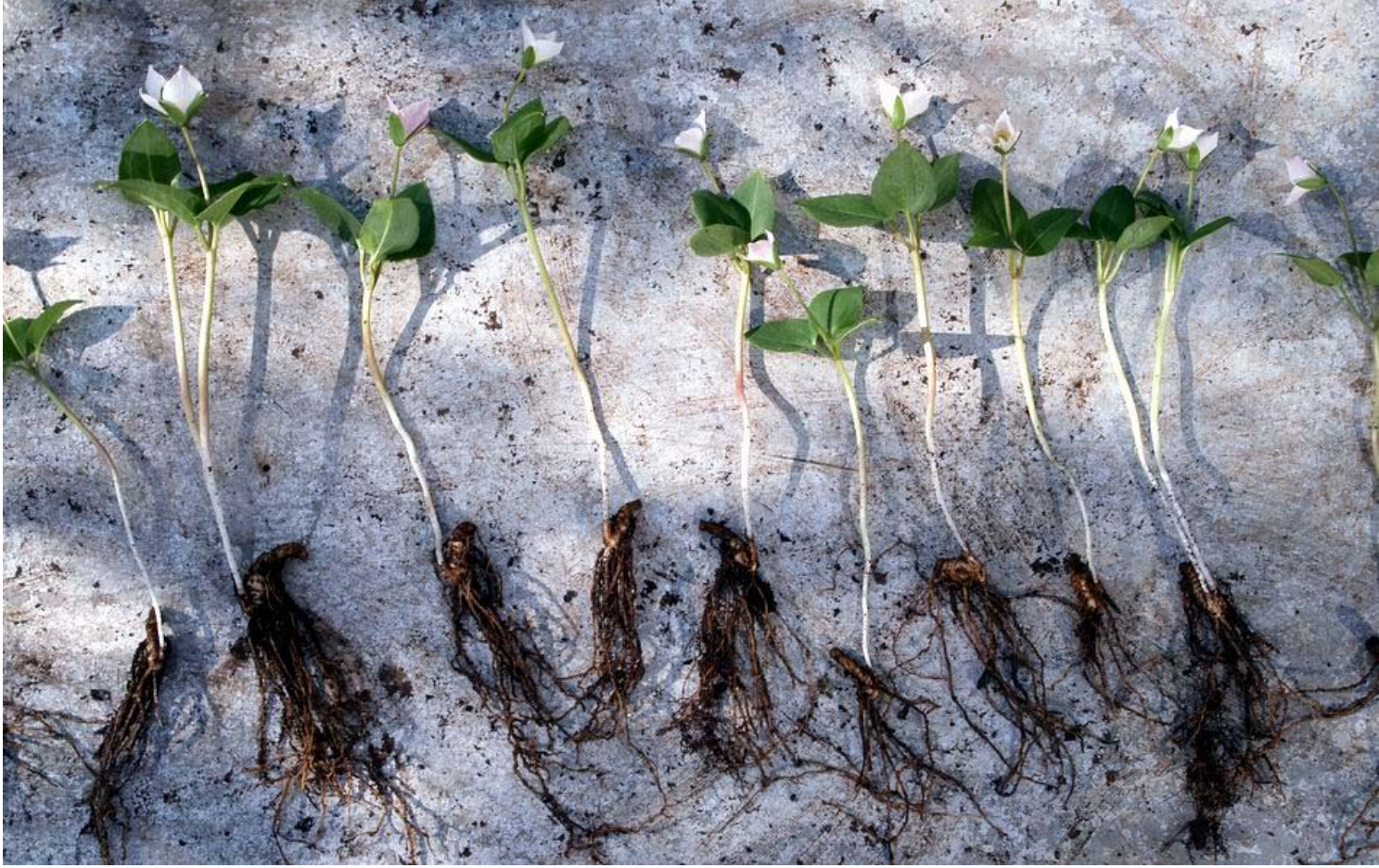
Each clone can now be planted separately and as you can see the roots hardly know they have been disturbed