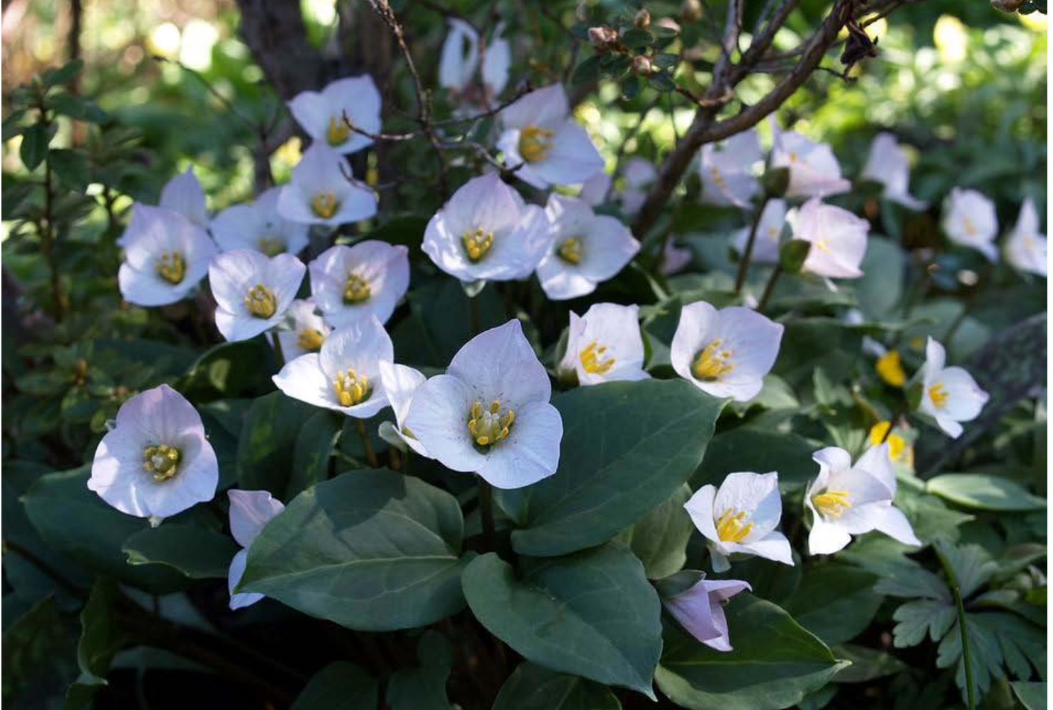
In a week when there is so much coming into flower in the garden and I have hundreds of pictures I have decided to devote Bulb Log 14 to one of my all time favourite plants.