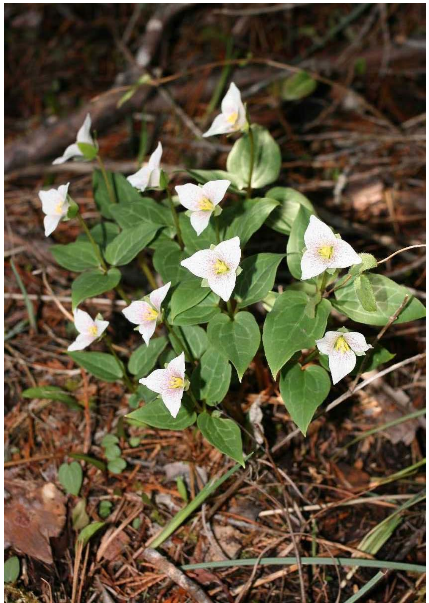
I was delighted to be able to see Trillium rivale in the wild in Oregon in the company of, among others, Ed Alverson who took the picture of me sitting beside a step wooded riverside bank covered in Trillium rivale and Erythronium citrinum.