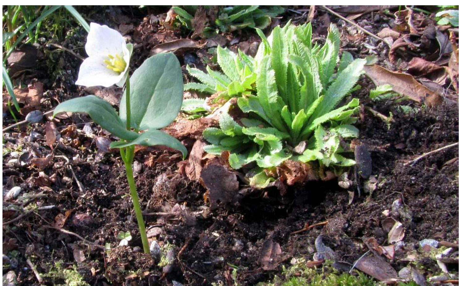
Trillium rivale in garden

Observe the stems and you will see from the colour change the depth that they were sitting at previously and make sure that you plant them to around the same depth.