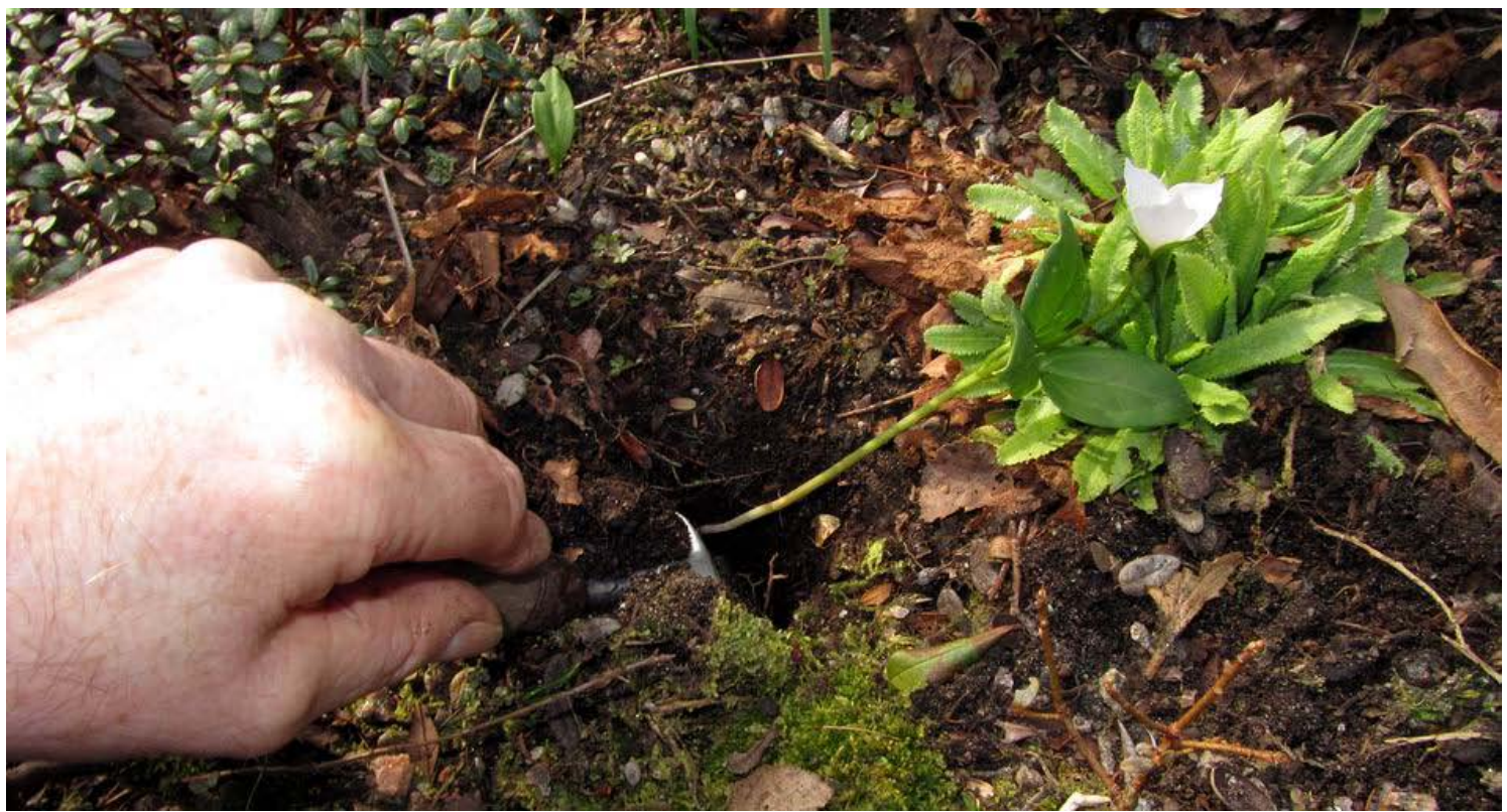
Having knocked the flowering seedlings out of the pot I plant them singly along the bank of another humus bed by making a deep slot with a trowel to accommodate the full length of the roots.

Sometimes a plant will produce two shoots and start to form a clump as above : others seem to be reluctant to do this and just remain as a single stem for a long time. If the main shoot is lost or damaged secondary buds can form along the length of the rhizome. You can encourage extra buds by making a shallow cut the along the length of the rhizome which, with luck, will result in buds forming at each of the ridges of previous year's growth. A more extreme method is to remove the main bud cutting just behind where the new roots have emerged. This will leave the new bud with its roots; the older parts of the rhizome with its roots attached should, now the dominant shoot has been removed, form secondary buds. Just think: it is exactly the same process of removing the dominant bud from the stem of a chrysanthum to encourage multiple flowers rather than a single large one – except the trillium stem runs underground.